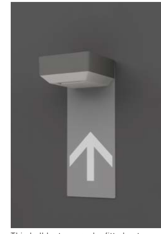
This hall lantern can be fitted onto any building wall work by applying a screen that secures the brightness of the direction arrows and conceals existing construction holes during modernization work.